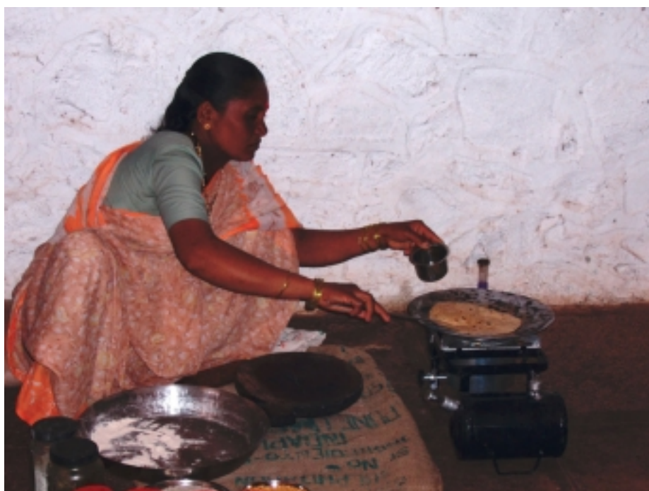
Fig. 3. Ethanol stove in use

Ten stoves have been fabricated and are undergoing large scale testing for user performance evaluation. Fig. 3 shows a woman cooking on the ethanol stove during field-testing.