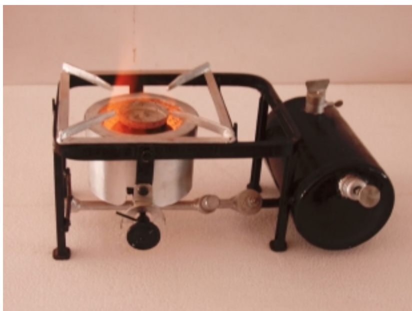
Fig. 2. Ethanol Stove