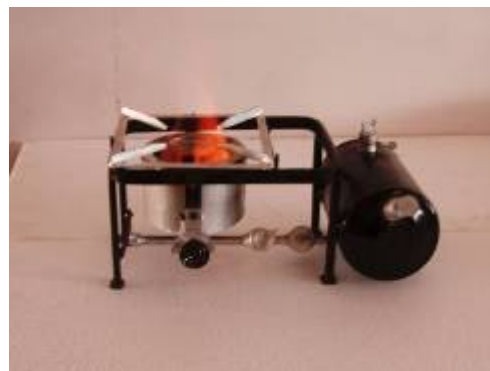
Ethanol pressurized stove

Development of protocols for jaggery and syrup production