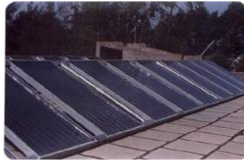
Fig 2. Solar powered ethanol distillation plant

An improved, multifuel lantern called “Noorie” was developed. It is a pressurised mantle lantern producing light output of 1250-1300 lumens (equivalent to that from a 100 W light bulb). Compared to existing pressurised kerosene lanterns, this lantern consumes only 60% of the kerosene and operates at one-third the pressure. It can run on kerosene, low concentration ethanol or diesel. Ethanol concentrations of a minimum of 50% (v/v) are required [5]. A pressurized alcohol stove has also been developed. It requires a minimum ethanol concentration of 50% (v/v). Its heating capacity is 3 kW for 50% (v/v) ethanol concentration and its thermal efficiency is between 50-55%.