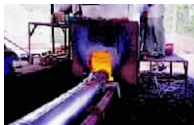
Gasifier with the heating furnace

The gasifier also produces char [20% w/w of input biomass feed] as a by-product. It can be mixed with a suitable binder like cowdung (15% w/w) to form briquettes using a hand-operated briquetting machine [9]. These briquettes are smokeless and make an excellent fuel for chulhas (traditional cooking stoves). Experiments were carried out to study the potential of this char as a soil conditioner. Various crops were grown on soils treated with different doses of char, without any adverse effects.