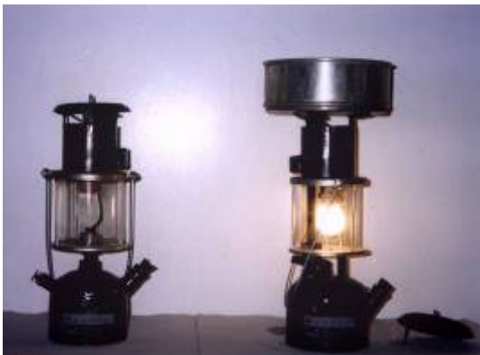
Noorie lantern with cooking

An improved, multifuel lantern called “Noorie” was developed. It is a pressurised mantle lantern producing light output of 1250-1300 lumens (equivalent to that from a 100 W light bulb). Compared to existing pressurised kerosene lanterns, this lantern consumes only 60% of the kerosene and operates at one-third the pressure. It can run on kerosene, low concentration ethanol or diesel. Ethanol concentrations of a minimum of 50% (v/v) are required [5]. A pressurized alcohol stove has also been developed. It requires a minimum ethanol concentration of 50% (v/v). Its heating capacity is 3 kW for 50% (v/v) ethanol concentration and its thermal efficiency is between 50-55%.