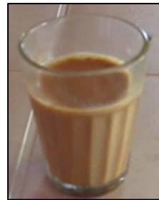
My day was incomplete without the morning and evening tea

The projects I worked on while at NARI are as follows: