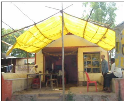
Local Dhaba where I had lunch everyday

Living in quarters in the midst of fields and cattle, riding a bicycle to work everyday and eating and enjoying tea at a roadside dhaba was truly an enjoyable and unforgettable experience. While at NARI, I met some of the most interesting co-workers who made me feel very welcomed and my stay even more pleasurable.